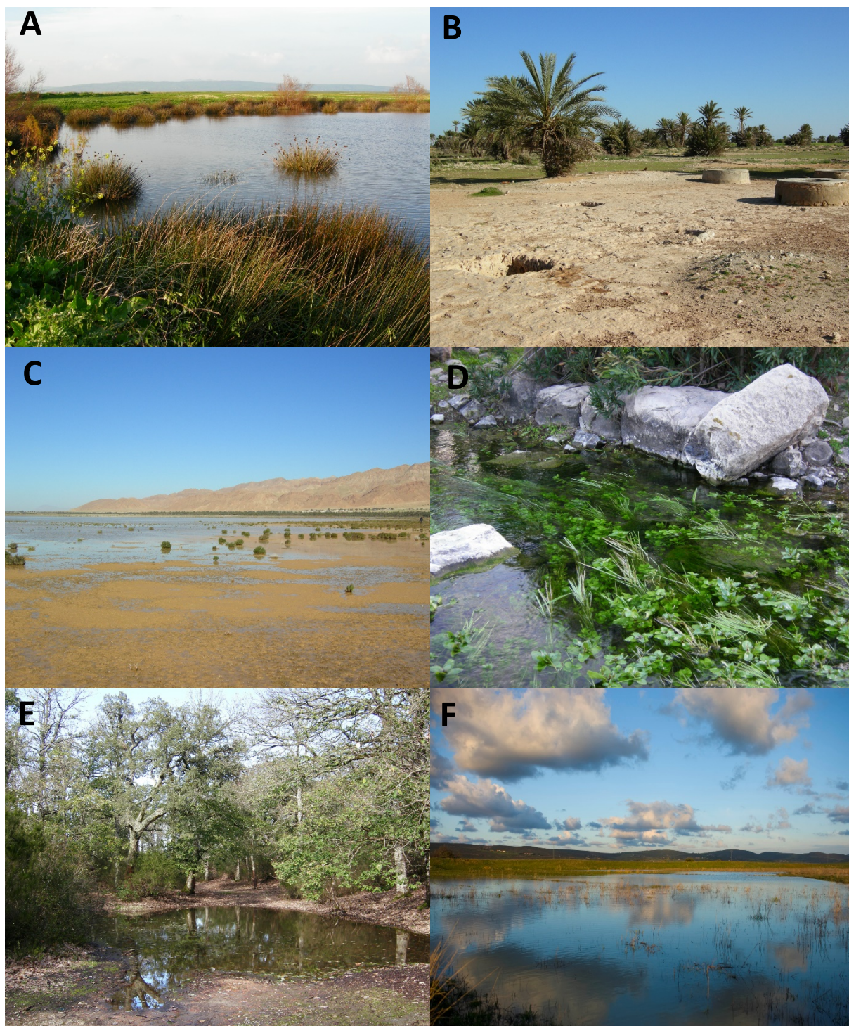
Fig. S2. Photographs of some sampling sites surveyed in this study (site codes as in Tab. 1). A. F110; B: F124; C: F131; D: F146; E: F166; F: F234.