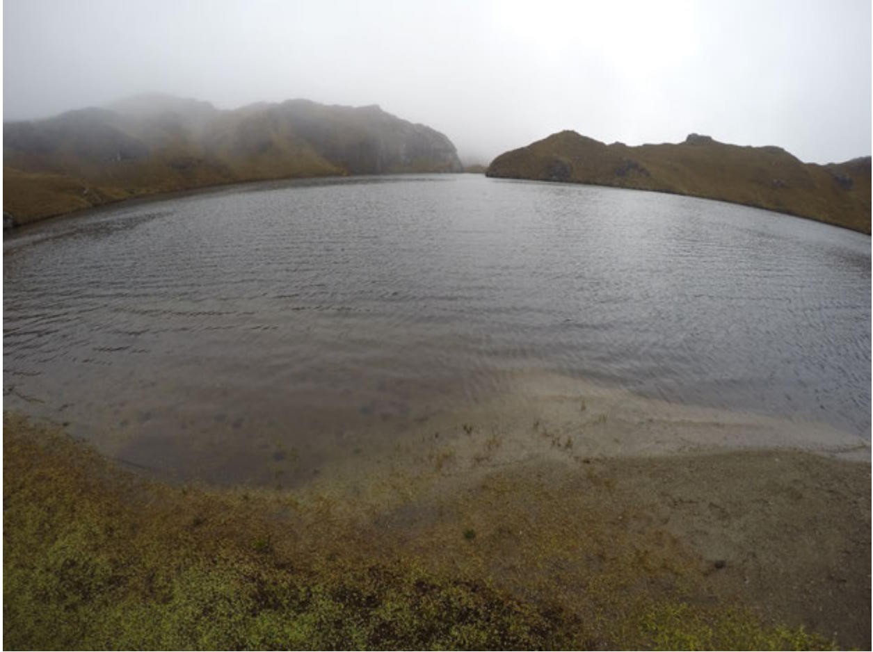
Supplementary Fig. 4. Photograph of Laguna Fondo Cocha in Cajas National Park, Ecuador.