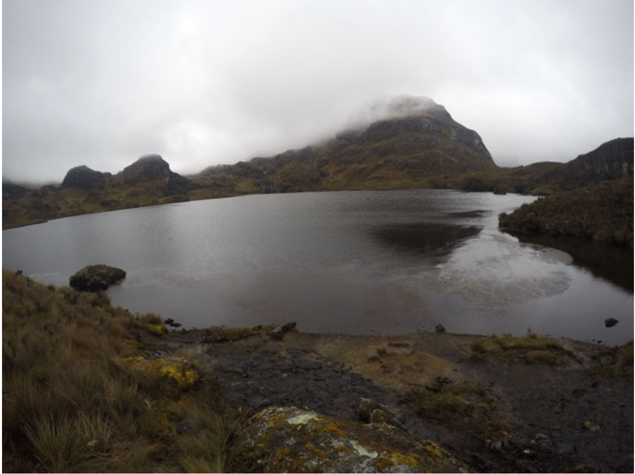
Supplementary Fig. 3. Photograph of Laguna Toreadora in Cajas National Park, Ecuador.