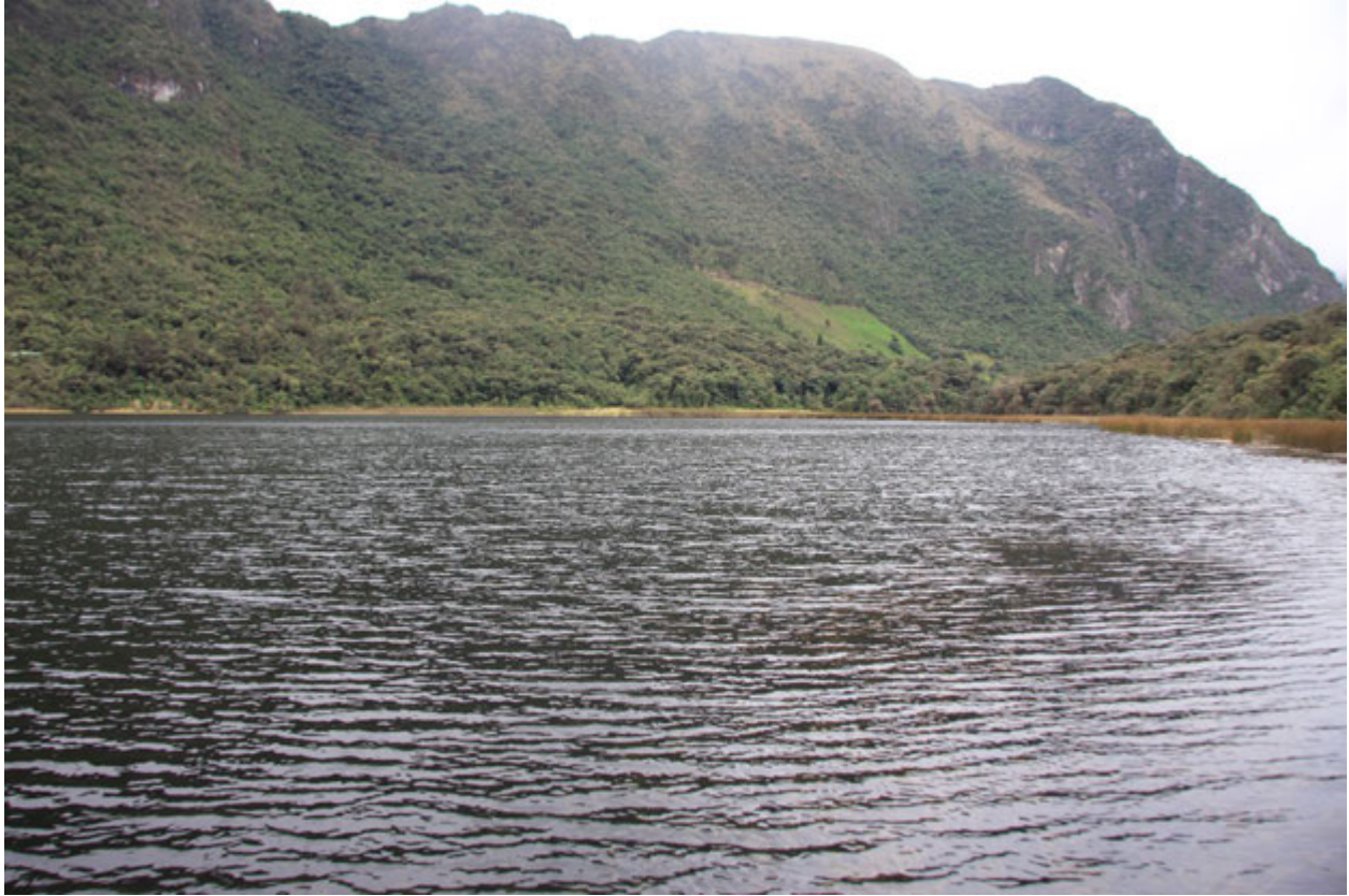
Supplementary Fig. 1. Photograph of Laguna Llaviucu in Cajas National Park, Ecuador.