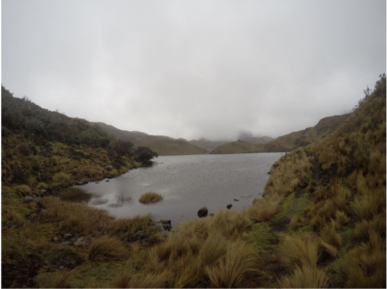
Supplementary Fig. 2. Photograph of Laguna Patoquinas in Cajas National Park, Ecuador.