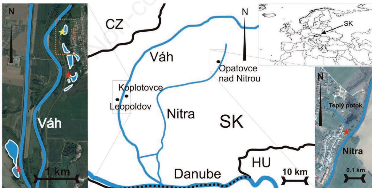
Fig. 1. The marbled crayfish ( Procambarus fallax f. virginalis ) occurrence in Slovakia. Black lines in the central map indicate country borders, blue lines indicate the river network, and the orange rectangle represents privately owned and thus inaccessible sites. Red stars represent newly discovered marbled crayfish populations, while the yellow star represents the original site of the first record in the country.

This is the first site from which the marbled crayfish was first reported in Slovakia (Janský and Mutkovič, 2010), it comprises seven adjacent groundwater-fed gravel pits (Fig. 1) ranging in area from 1600 m 2 to 21,600 m 2 . The gravel pits freeze over in winter (with the bottom temperatures not exceeding 4°C), while the epilimnion warms up to 23–25°C in summer. Two of these pits (one being the site of the first marbled crayfish record for Slovakia) are privately owned. The area of the gravel pits is separated from the adjacent Váh River by an embankment that provides protection from the occasional floods. The pits have fluctuating water level and varying depth (up to