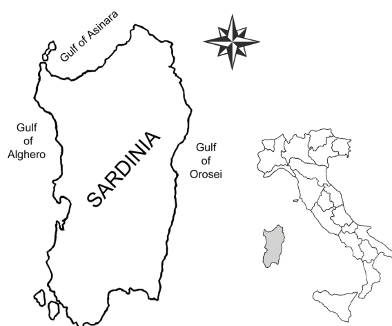
Fig. 1. Location map of Sardinia (Italy) sampling localities.

by washing in tap water and collecting them on a 42 µm mesh size sieve. Kaiser's glycerol-gelatin or Hoyer's fluid were used for making permanent mounts (Higgins & Thiel 1988). Identification and taxonomic studies on tardigrades were performed with a light microscope (Leica DM 2500) equipped with phase contrast and interference contrast. Abundance of tardigrades collected via 6.2 cm 2 corer, was calculated from the surface area sampled and reported to number of individuals per 10 cm 2 . In addition, Shannon-Wiener's diversity (H') and Pielou's indices (J') were calculated. Sediment was analysed for granulometry.