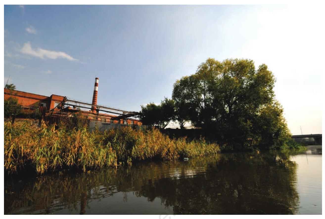
Fig. 4. The view of the habitat of M. glutinosa in Chelyabinsk City (Miass river).

inhabit calcium-deficient waterbodies. Moreover, M. glutinosa is not tolerant to low values of ambient pH (Salazkin, 1969; Berezina, 2001).