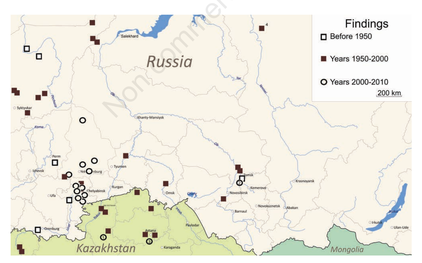
Fig. 1. Findings of M. glutinosa in the Urals and Siberia. Numbers 1-4 correspond to some remarkable findings of the species in Siberia (see text).

The southern border of the glutinous snail range in Siberia lies somewhere in Central Kazakhstan. Recently,